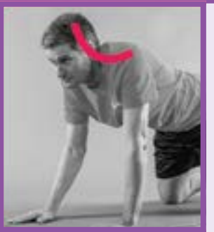
DO NOT allow your shoulders or hips to rotate